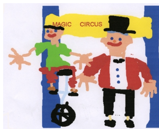
Computer Art by Shauna age 7 Newland Primary School, Hull

The acrobats were not in the Magic Circus show - they had gone on the bus. Can you paint a picture of their act. They do somersaults, they balance on each others heads, six people high!! Or cut out acrobats using stiff card. Shape their hands and feet in the form of a hook and hang them in the classroom from string like a mobile.